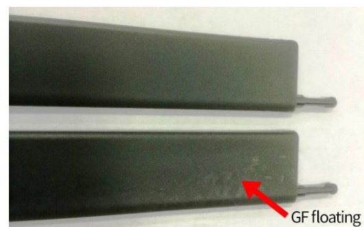
Top : VYLOPET EMC-060A Bottom : PBT + PET-GF50

*Values and properties listed here are typical values, not guaranteed values.